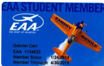
Student Membership Card