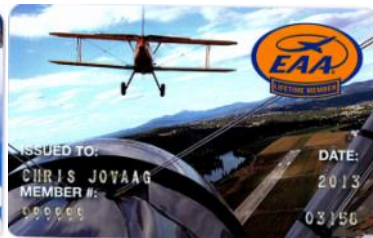
Lifetime Membership Card