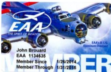
Annual Membership Card