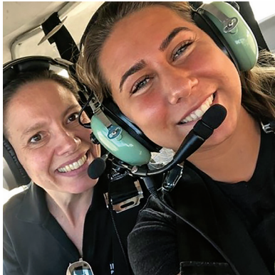
No Mic Mouth!