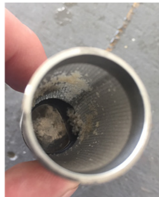
Figure 1. Fuel screen contaminated with DEF crystals following the 2019 fuel contamination event.

At both airports, all 12 aircraft that were directly exposed to DEF experienced service difficulties and unplanned diversions resulting from clogged fuel filters and fuel nozzle deposits (see the special airworthiness information bulletins [SAIBs] listed below for more information).